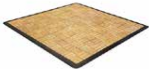
Faux Wooden Dance Floor 3' x 3' Sections

There are a few things that you'll need to determine in order to get the proper dance floor size for your event.