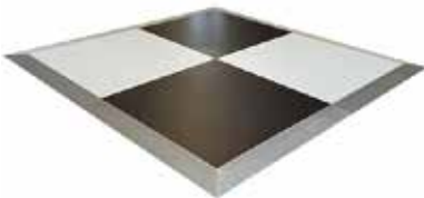
Black & White Dance Floor 4' x 4' Sections