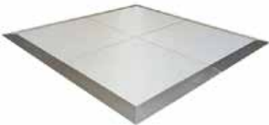
White Dance Floor 4' x 4' Sections